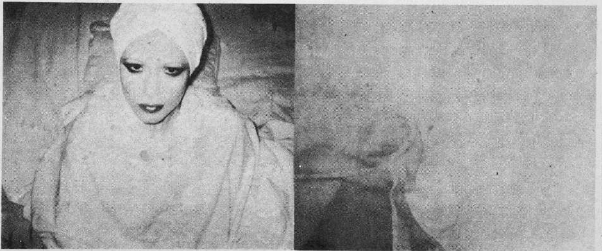
c'est quelque chose de crépusculaire, de bleuâtre et de rosâtre, un rêve de volupté pendant une éclipse