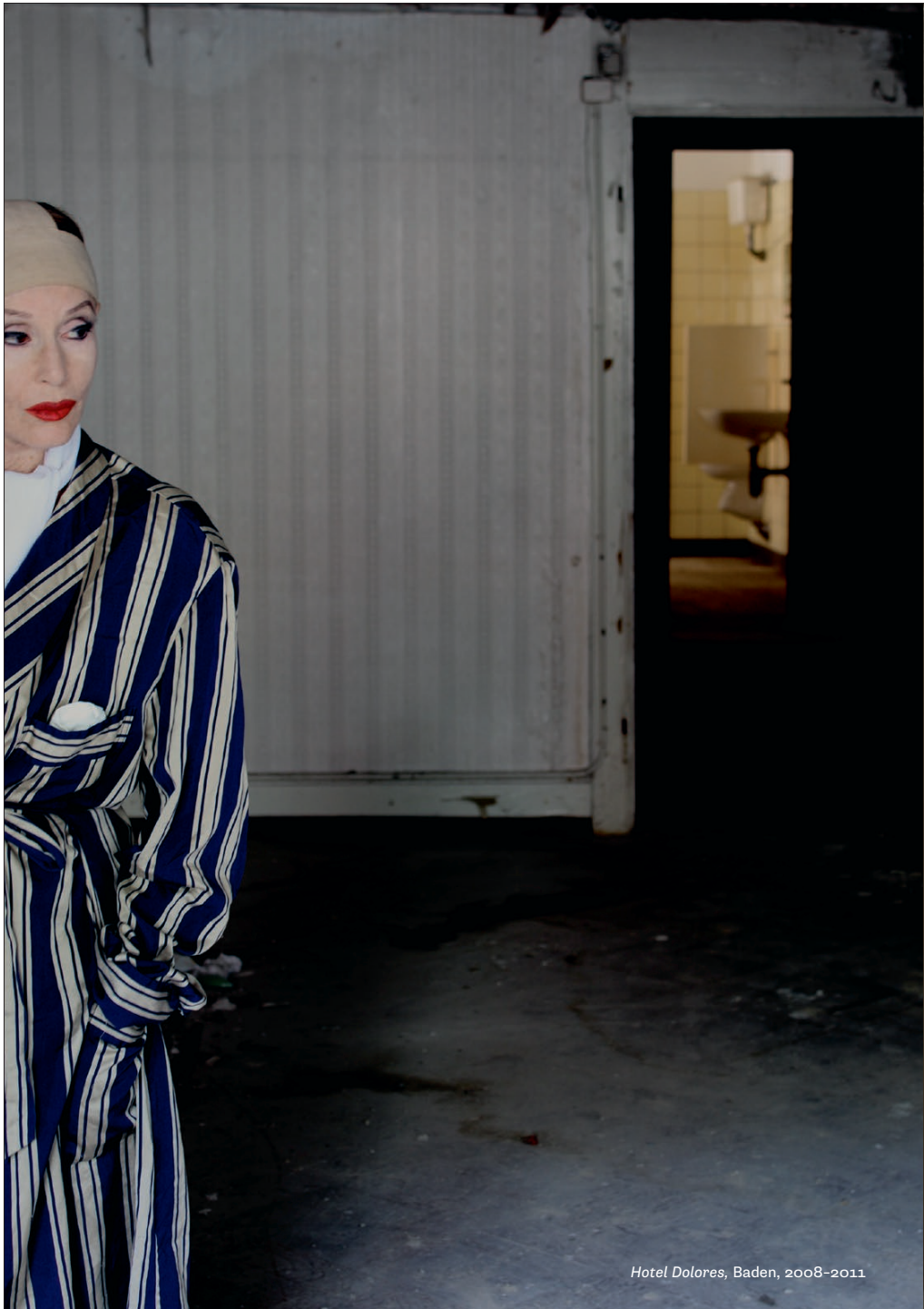
Hotel Dolores, Baden, 2008-2011